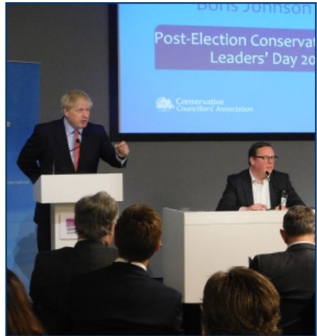
The Prime Minister taking questions from CCA Members at the Group Leaders' Day 2019.

The number of Cabinet members will vary from authority to authority, but it will include the Leader of the Council and senior councillors responsible for particular aspects of policy (housing, education, etc). These are known as 'portfolio holders'. Portfolio holders work closely with council officers and are responsible for the specific details of their brief as well as ensuring the implementation of agreed policy decisions. As these decisions affect the level and quality of